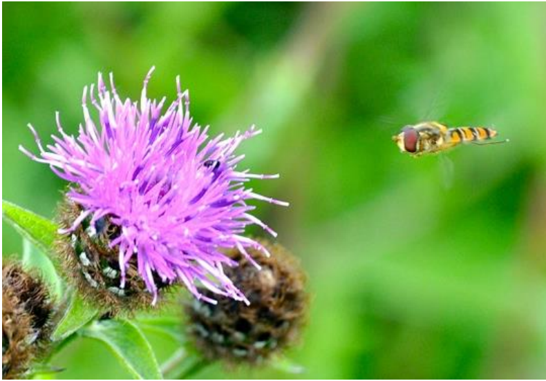
Hoverfly picture provided by Tony Whittle