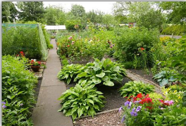
Stan and Audrey's garden viewed from their gate